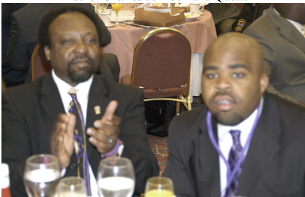
Father and Son