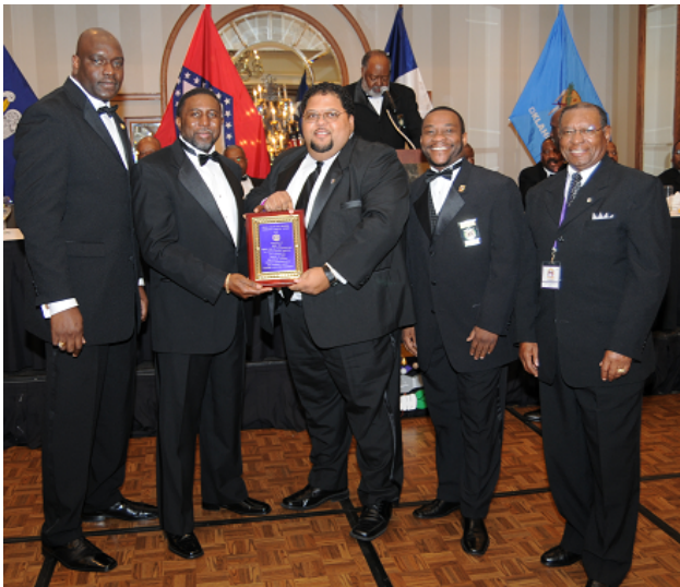
Small Graduate Chapter of the Year

cost effective measure and it worked very well in Houston at last year's District Meeting.