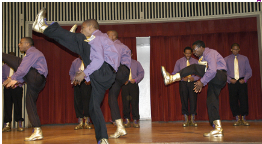
1st Place Alpha Delta Lambda