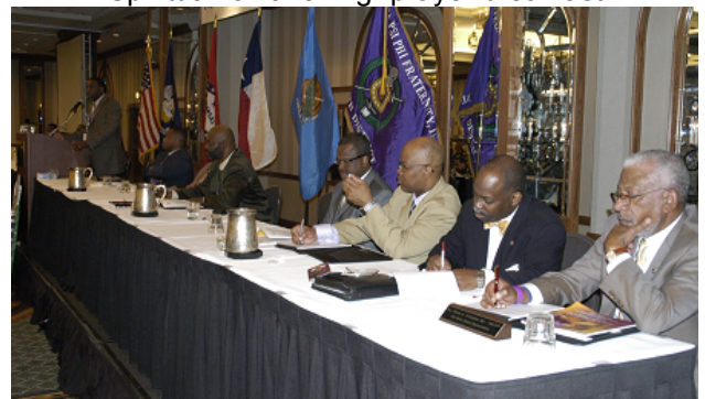
Former 9 th District Representatives