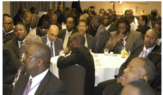
Spiritual "awakening" prayer breakfast