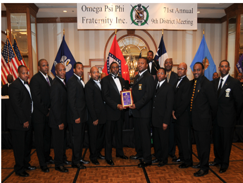
9 th District Graduate Chapter of the Year Omicron Gamma Gamma Arlington, TX

Houston, TX. A highlight of the District Meeting is recognizing brothers for excellence in a variety of areas. Brothers who have excelled in performance and community service during the year and those who excelled in various sporting events were recognized at the Founders' Banquet.