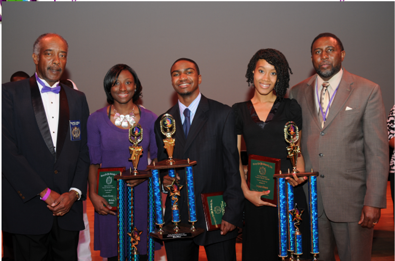
2008 Talent Hunt Winners