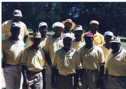
Theta Alpha Chapter Dallas, Texas